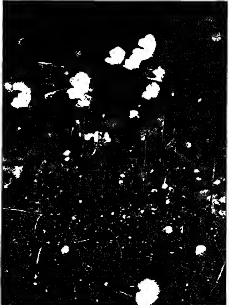
The utricularia is the only carnivorous plant known to grow naturally in Israel. (Amikim Shuv)